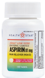
Aspirin, Enteric Coated Tablets, Low Dose, 81 mg. Count: 120