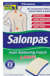
Salonpas® Patch Count: 6