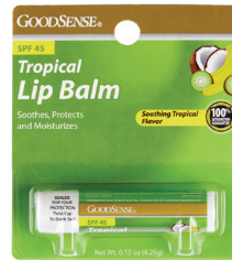
Medicated Lip Balm, 0.15 oz. Count: 1