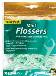
Interdental Flossers Count: 90