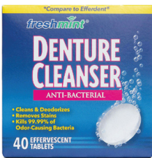
Denture Cleaning Tablets Count: 40