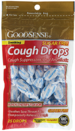
Cough Drops, Sugar-Free, Black Cherry Count: 25