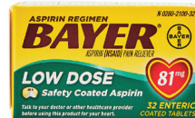
Bayer® Enteric Coated Aspirin, Low Dose, 81 mg. Count: 32