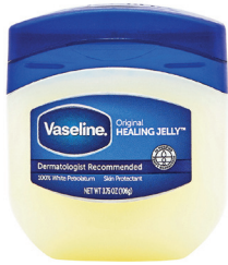
Vaseline® Jelly, 3.75 oz. Count: 1