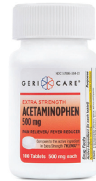
Acetaminophen Extra Strength Tablets, 500 mg. Count: 100