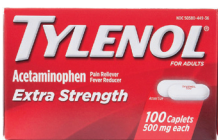
Tylenol® Extra Strength Tablets, 500 mg. Count: 100