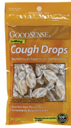
Cough Drops, Honey Lemon Count: 30