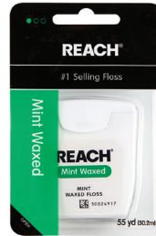
Dental Floss, Reach® Mint Waxed Count: 1