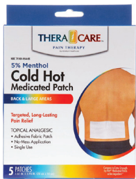
Cold Hot Medicated Patch Count: 5