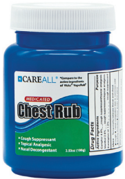
Vapor Rub, 3.5 oz. Count: 1