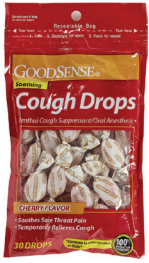
Cough Drops, Cherry Count: 30